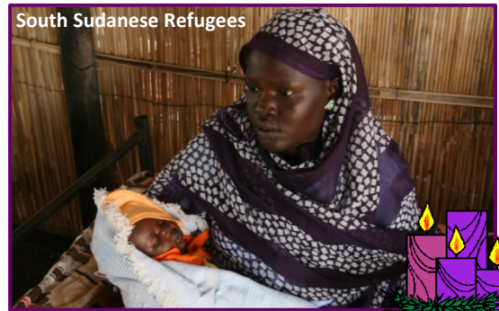
South Sudanese Refugees

“When immigrants are the victims of xenophobia, racism & political rhetoric, it’s up to followers of Jesus to be their most fervent defenders and to love them as Jesus did and does.”