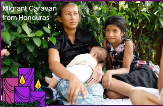
Migrant Caravan from Honduras